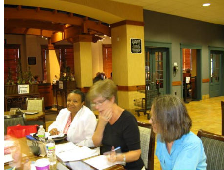
Board members hard at work at the August meeting