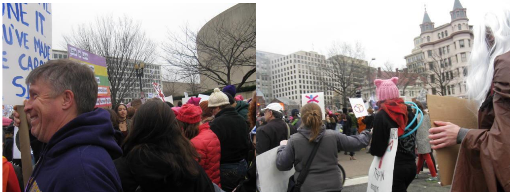
Marchers going down Pennsylvania Avenue