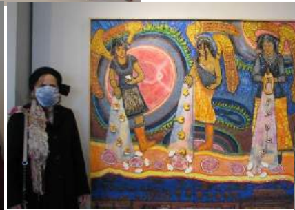
The Story of the Ham