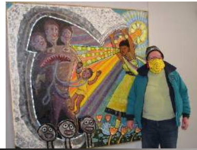
Ida B. Wells